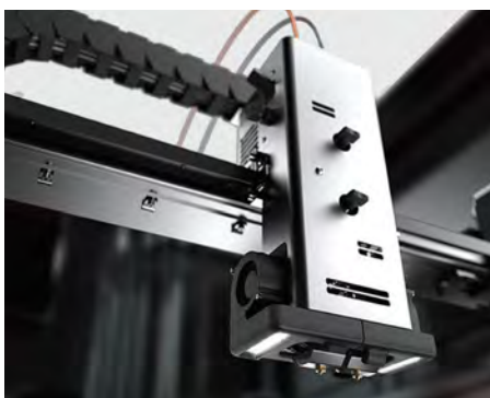
Studio Dual Extruder (SDX)