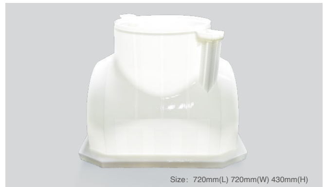
Size: 720mm(L) 720mm(W) 430mm(H)