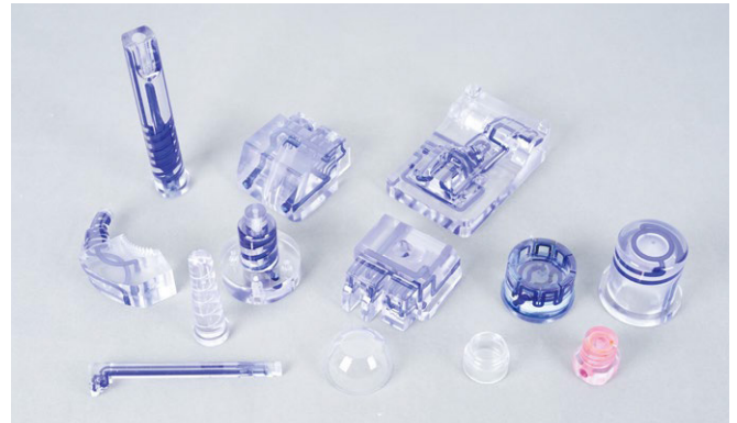
· Transparent resin parts